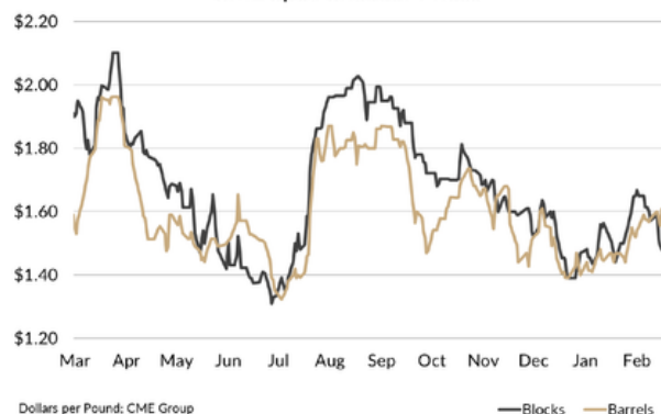
CME Spot Cheddar Prices